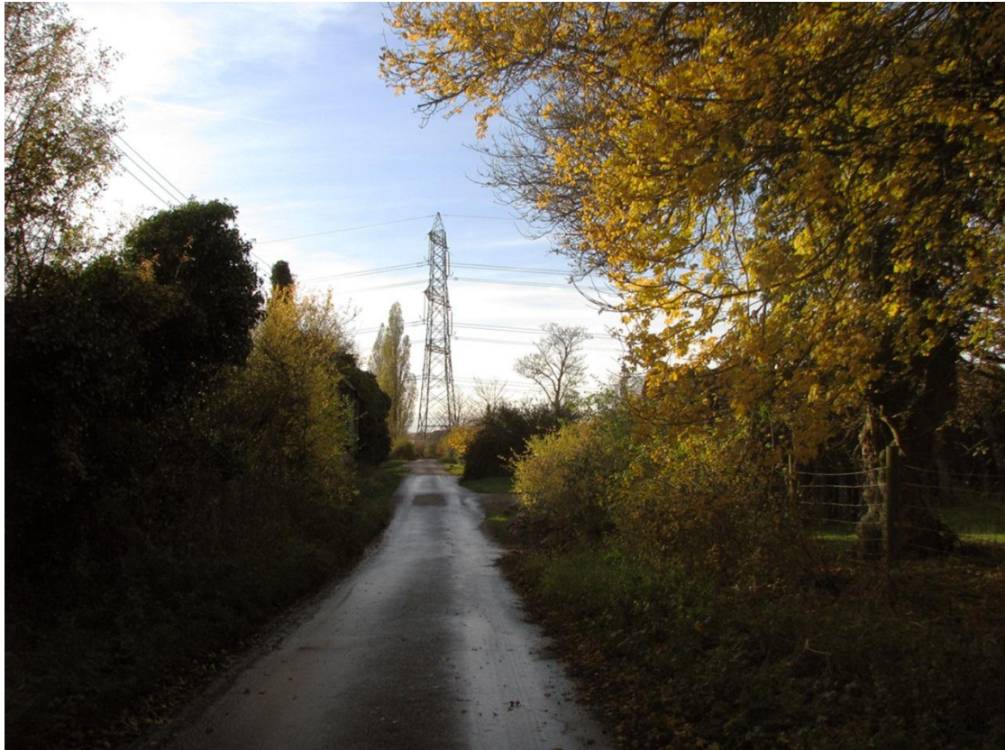
Figure 10 - Modern intrusion on aesthetic view of Lorkin Lane (BTE Lane 85)