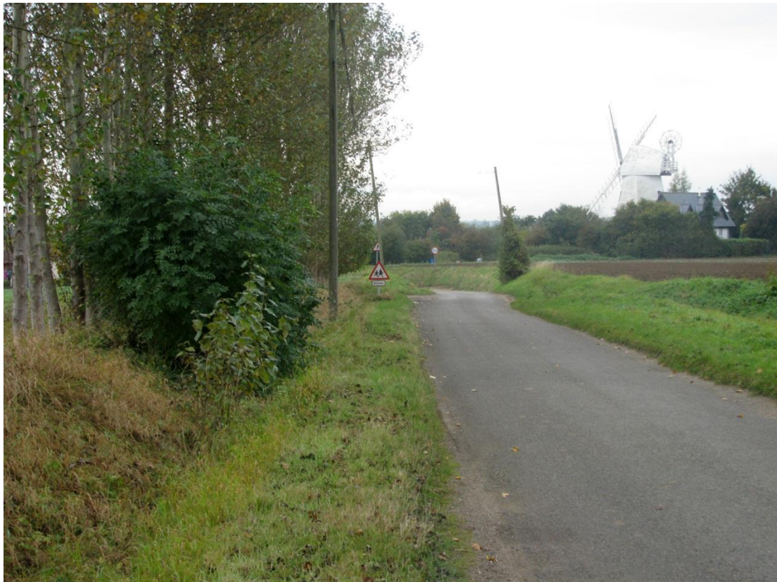
Figure 9 - Waltham Cross Road with view of Great Bardfield Windmill (BTE Lane 43)

Views – notable views, which are particularly scenic, unusual or which include contemporary historic features of note e.g. a parish church, listed building, farm complex or landscape that are framed by the lane and/or its associated vegetation were identified.