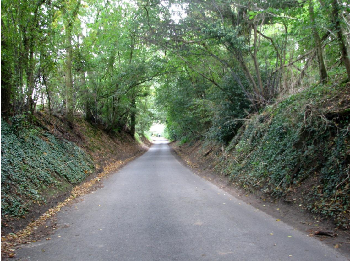
Figure 4 - Sunken lane at Hulls Lane (BTE Lane 35)