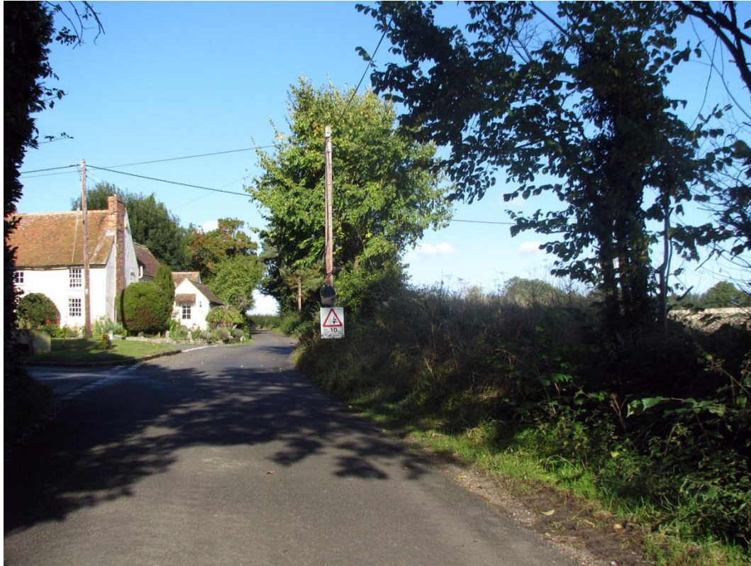
Figure 7 - Fairstead Road showing improvements of kerb stones and road signs (BTE Lane 13)

Description of improvements – this was a description of any significant improvements that had been made to a lane along the length of the unit of assessment. The description included information on the type and extent of traffic calming measures and other ‘improvements’ such as widening, kerbing etc.