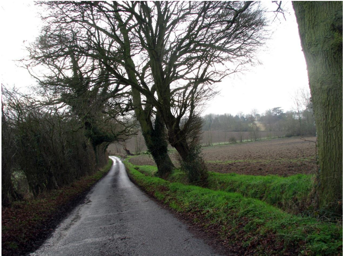
Figure 2 - Change in form of lane with drop into the valley (BTE Lane 125)