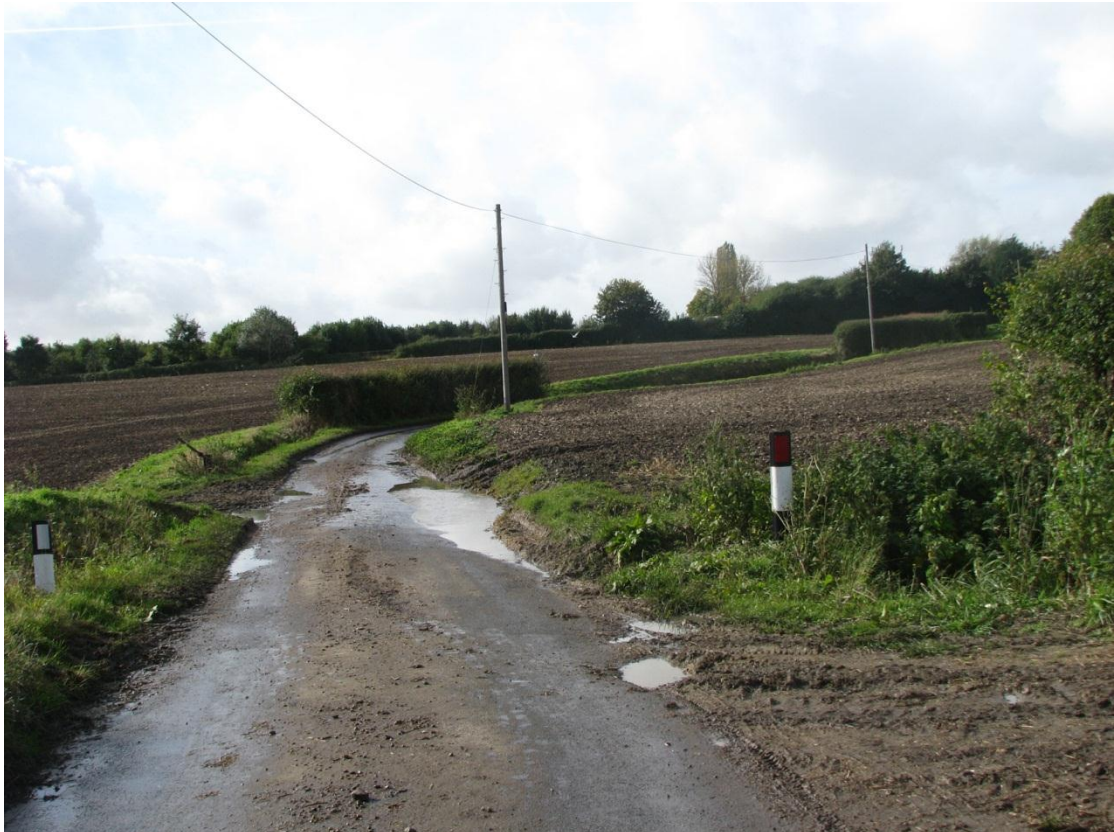
Figure 6 - Shows area of disturbance from field entrance and agriculture up to the edge of the lane (BTELane 64)

Description of erosion damage – this was a description of erosion damage to the structure of the lane from vehicular traffic along the length of the unit of assessment. The description included information on damage to banks, verges and surfaces.