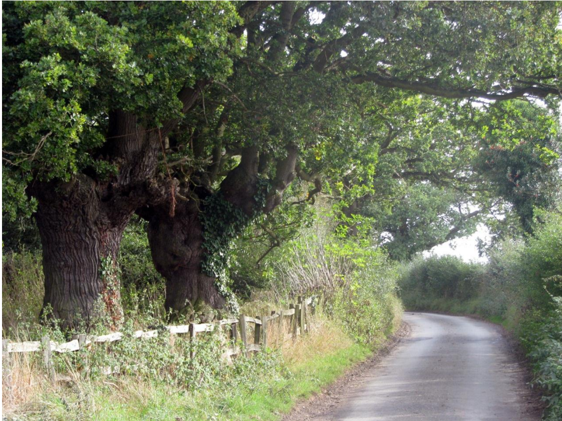
Figure 5 - Veteran pollards (BTElane 4)