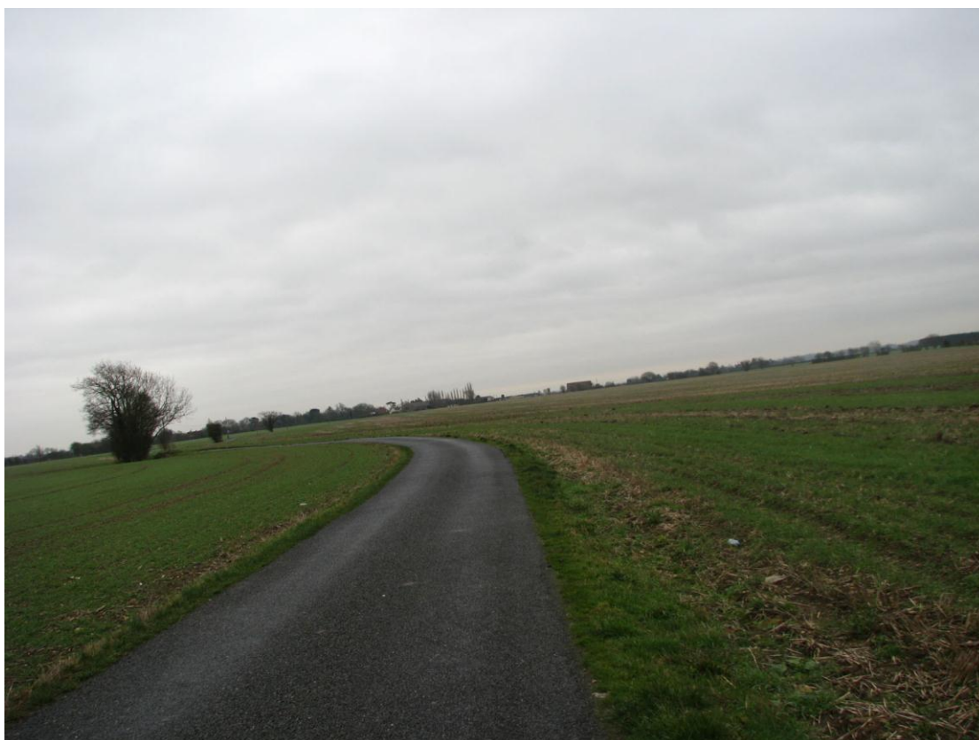
Figure 12 – Agricultural production to edge of road with the removal of the verge, ditch and hedgerow (BTELANE140)