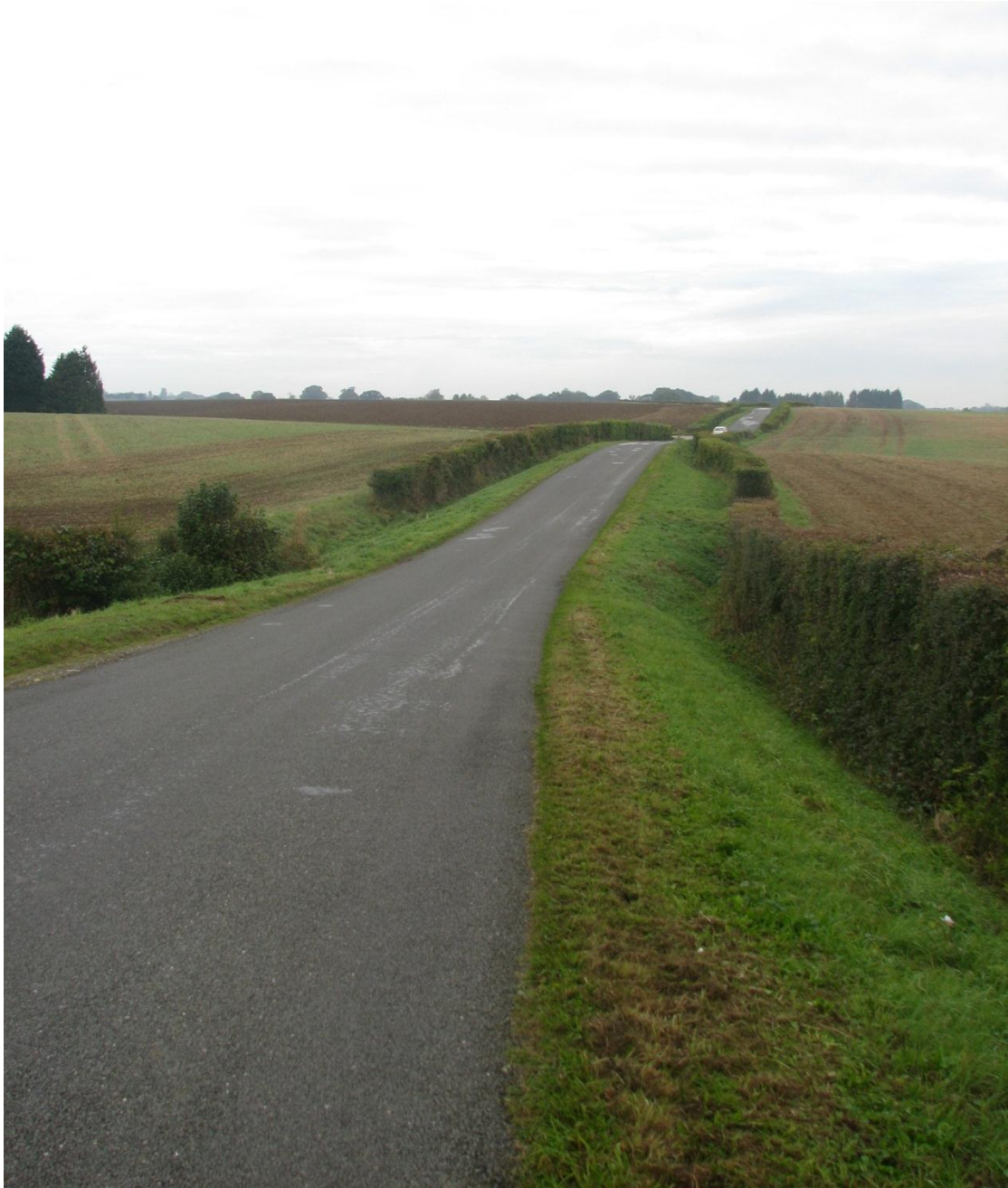
Figure 3 - Verges on undulating lane at Shalford Road (BTE Lane 24)