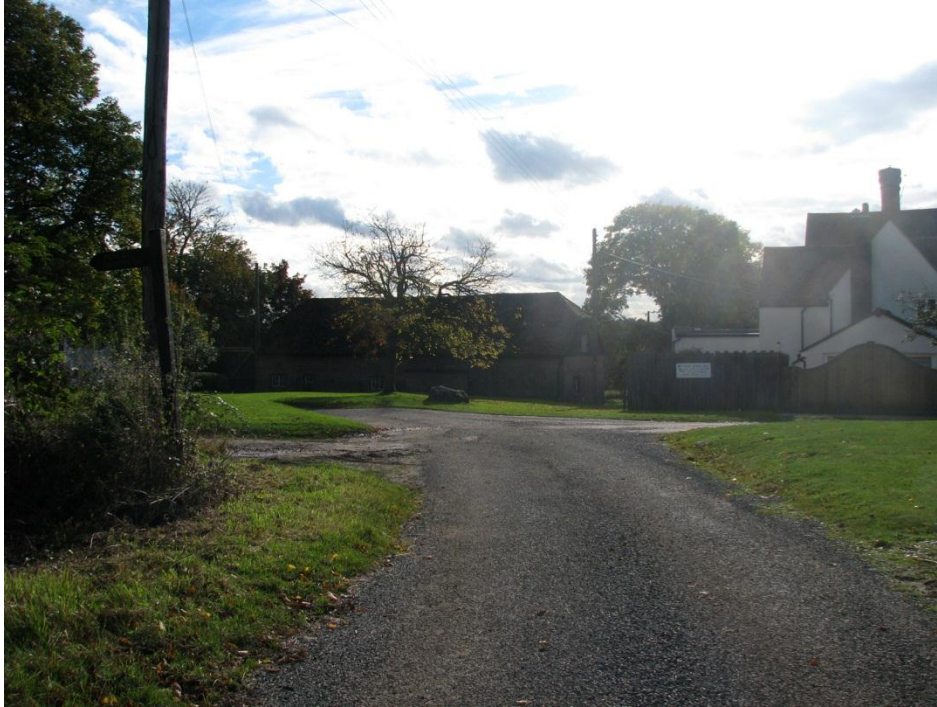
Figure 8 - Greens at Codhams Lane forming part of the important historic settlement associated to this short length of lane (BTE Lane 28)

Archaeological potential of the lane and its associated features such as the ditches, banks and greens etc. These features can all contain important archaeological remains that relate to the development and human interaction with the landscape.